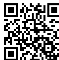
Figure 1 - Scan the QR code for Product Information and Coding Video